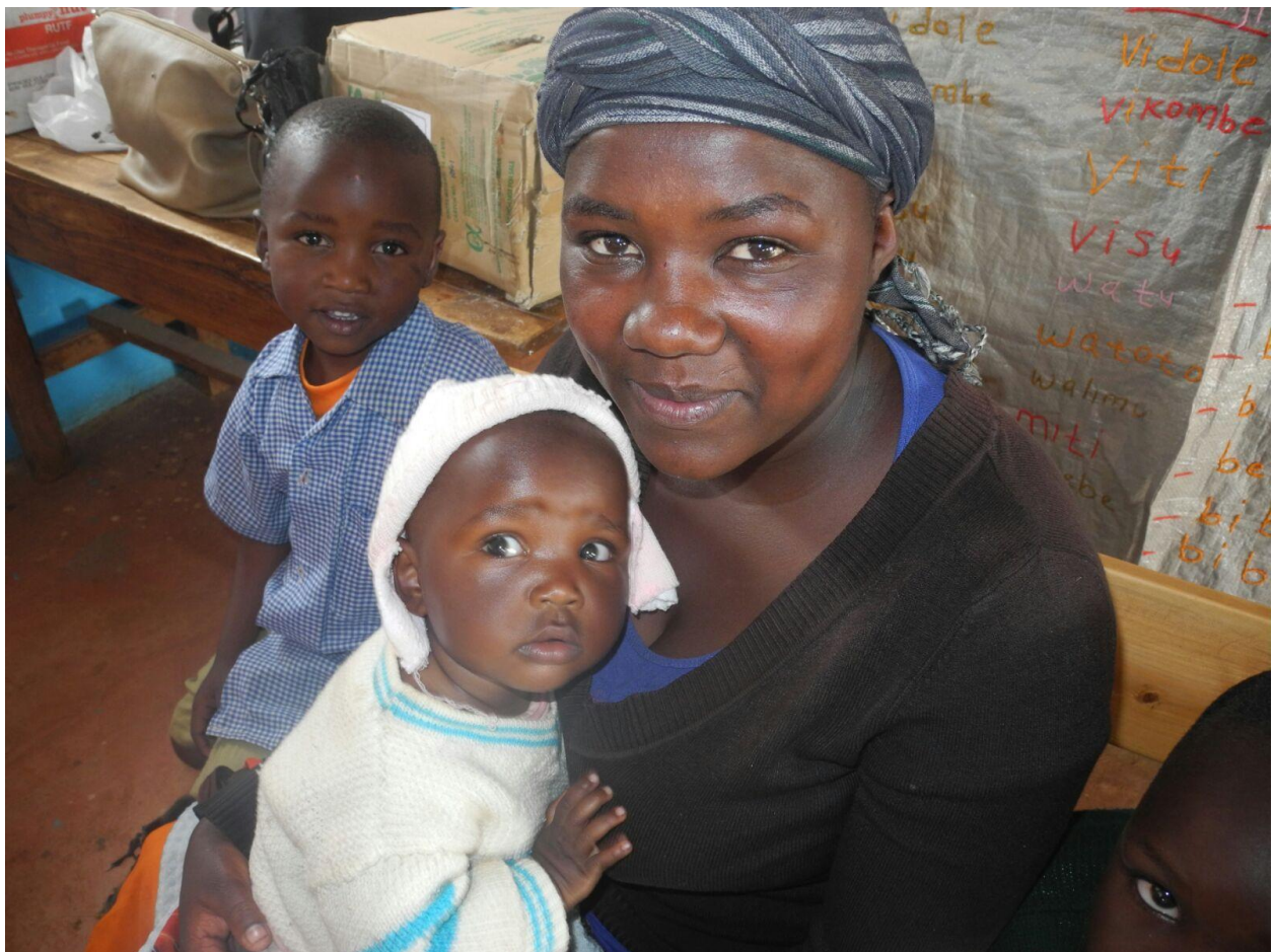
Parents happy to be part of the medical screening

Also the medical checkup is meant to inform the parents on areas that require their attention