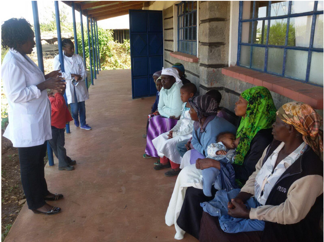
Parents/guardians being engaged by the medical team on feedback session

The parents were happy with the current state of medical screens but suggested enhancement of the same with addition of laboratory component and basic lab test to be included